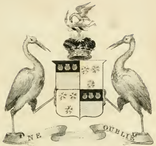
Graham, Duke of Montrose.