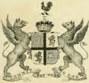
Sinclair, Earl of Caithness.