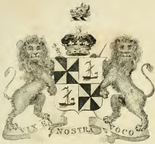
Campbell, Duke of Argyll.