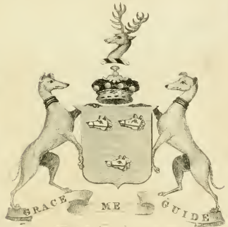
Forbes, Lord Forbes.