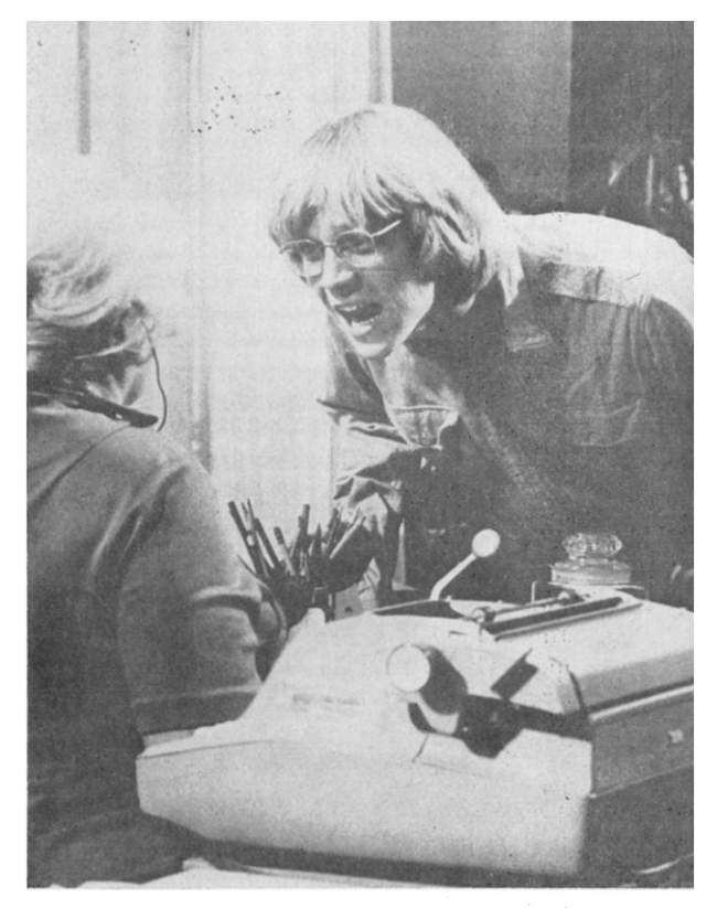
THE STRAWBERRY STATEMENT

The Strawberry Statement has angered some people because, like Getting Straight, it has an impudent, skeptical sense of humor about young people and their movement. Simon joins the strike primarily because he is interested in a girl he meets there. Once inside the occupied administration building, he seems more anxious to use the president's bathroom and to watch Mutiny on the Bounty on television than to take part in the radicals' debate about slanted news