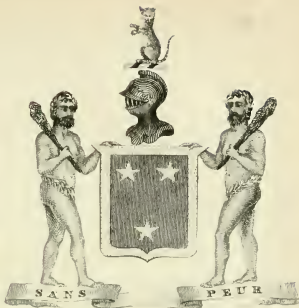
Sutherland of Fosse