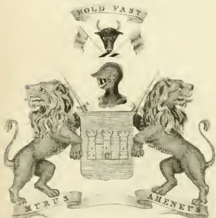
Macleod of Macleod