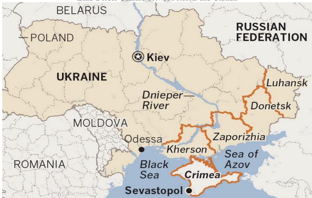
Map 1 Land Border Conflict between Russia and Ukraine