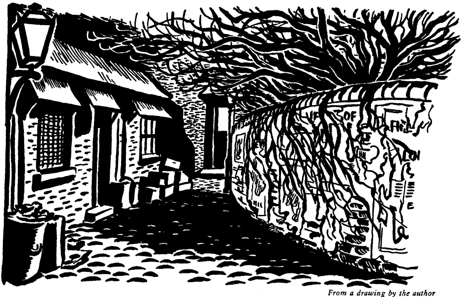
ALLEY BEHIND FUN FAIR

sale. Promptly there were complaints that it was harder to operate the sound booms in the narrow space and that I was slowing down production. (Incidentally, the sound boom is the usual pretext for allowing the most modest interiors to assume elephantine dimensions. Hollywood will gladly spend