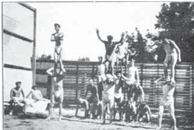
AND STRENGTH WHICH WOULD BE REMARKABLE, EVEN IN A YOUNG ATLETE.