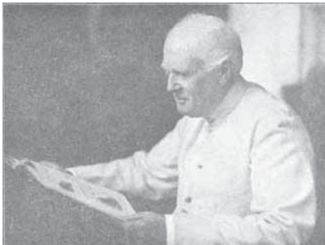
THE AUTHOR FEELING HIMSELF TO BE THE MOST FORTUNATE PERSON ALIVE.

stomach in much less time than later on. Appetite " peters put," as miners say, gradually, and does not stop with a bang and shut off like an electric light when connection is broken. It checks up, slows down, and tapers off gradually, and that is where the canny intelligence of a faithful Fletcherizer stands him in good usefulness. When Appetite gently says: " Now,