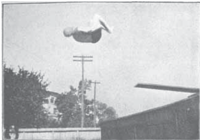
THE AUTHOR ON HIS SIXTIETH BIRTHDAY, PERFORMING FEATS OF AGILITY