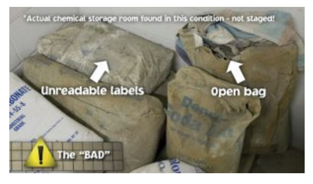
Figure 3. Example of improper chemical storage

When stored improperly, pool chemicals may chemically decompose, releasing chlorine gas, bromine gas or other toxic substances, which in poorly ventilated areas may corrode packaging, piping, electronics and other metal equipment. Fire is a danger when heat, an oxidizer and fuel combine. Common pool treatment chemicals (e.g., calcium hypochlorite, sodium dichloro-