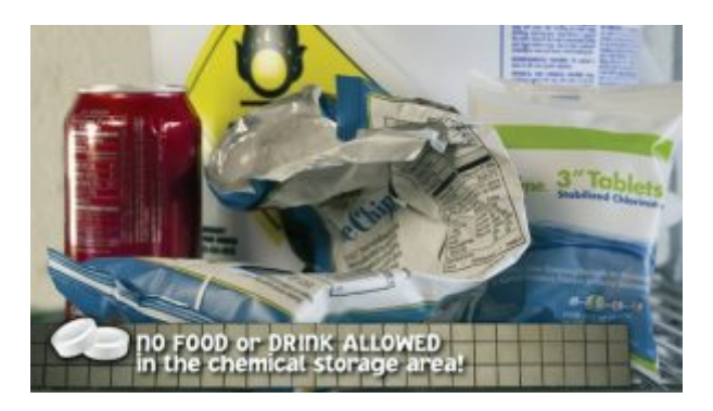
Figure 2. No food or drink in chemical storage areas

Last summer, according to an Associated Press report on NJ.com , a hot tub owner in New Jersey was injured as he diluted chlorine7 (presumably a chlorine-based liquid or solid disinfectant or a mixture of disinfectants) with water inside his home.8 A violent reaction ensued and the man was treated for burns to the face and difficulty breathing, according to the media report.